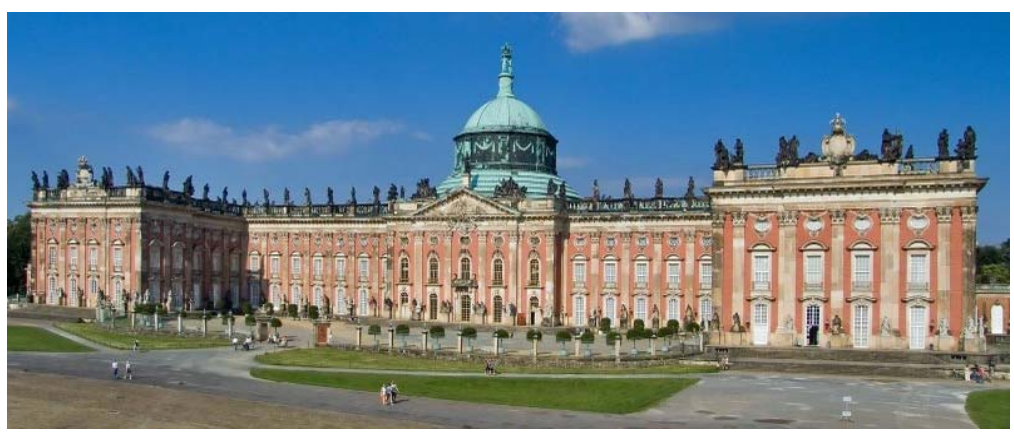
Potsdam University (Palais Sanssouci)

International Expert Workshop of the Research Centre SFB 700 July 3-4, Potsdam & Berlin